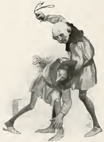
The cobbler whipped him unmercifully (P. 131.)

They made such an uproar that the steward came out to see what all the noise was about. He carried a whip in his hand and with it he laid about him right